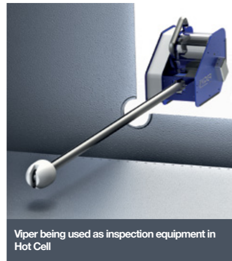
Viper being used as inspection equipment in Hot Cell

The powered or manual Viper can be deployed to undertake visual inspection or radiological measurement, via small aperture penetrations through radiological shielding or a containment barrier. This task can be performed easily and quickly, once the unit is manually positioned in front of the aperture. The Viper can be deployed horizontally or vertically, with the chosen instrument already mounted at the end of the tube. In addition to camera or radiological measurement sensors, the Viper can be fitted with lights and small, low powered tooling. For more remote environments, the viper could be mounted on unmanned, powered vehicles taking the power from the vehicle itself. The standard Viper system offers an open tube when deployed, however, it can be used to provide motion only when integrated with a carbon fibre telescopic mast or telescopic metal slides. The integrated versions offer higher load capacity and possibly, improved containment.