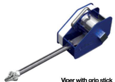
Viper with grip stick