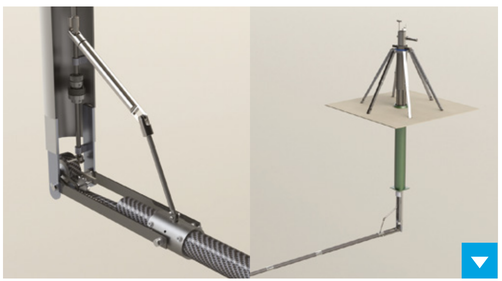
CLOSEUP OF HORIZONTAL ARM AND DRIVE MECHANISMS.