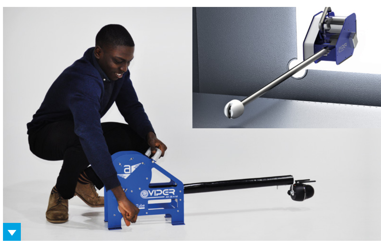
VIPER - REMOTE DEPLOYMENT SYSTEM USING BISTABLE REELED COMPOSITE.